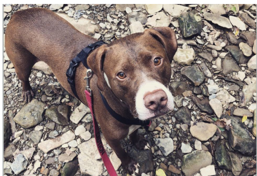
Another cute pic: Clark at the lake!